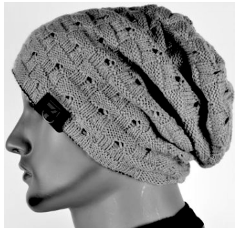
A style statement or a health hazard? - hats come under fire